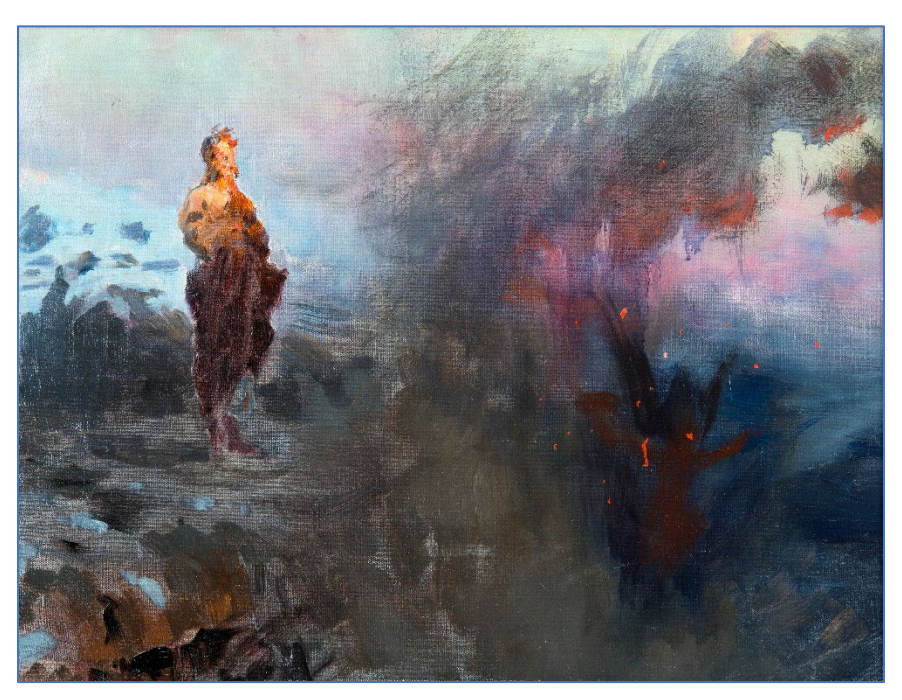
The Temptation Of Christ 1890 by Ilya Efimovich Repin